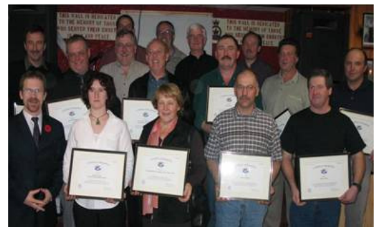
Certificate of Recognition recipients

The event as a whole was a success. Organizers of the event would like to thank everyone who attended and extend a special thanks to the Royal Canadian Legion, Branch 41 who provided the delicious meal and bar services for the evening.