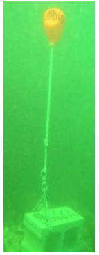
Photos: Trumpet stalked jellyfish (top left); Tunicate/sea squirt (bottom left); thermograph attached to cement block with buoy marker(right).

While the divers were deploying the loggers, they also took some beautiful underwater pictures. The divers will return to the Leading Tickles area next summer to retrieve the loggers and deploy new ones to record the water temperatures for another year.