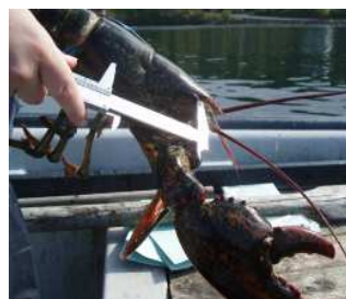
Amanda Marsh opens up the calipers to measure a big lobster in Glover's Harbour while her dad Ralph Marsh lines up a few more.